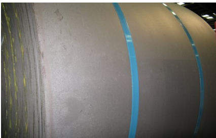
Regular P&O Product

BRUSHED P&O is a Pickled and Oiled Steel that has been correctively leveled under tension and passed through a series of brushes that produce a Smooth Cold Rolled like surface and removes the majority of the oil. Customers tell us that this product is flatter, smoother, has less oil, paints better and lasers faster than regular HR P&O. Visually, the product has a shiny, cold rolled appearance that not only looks better in its raw form, it also looks better as a painted part.