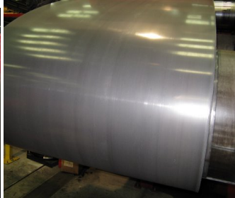
Same coil now Brushed